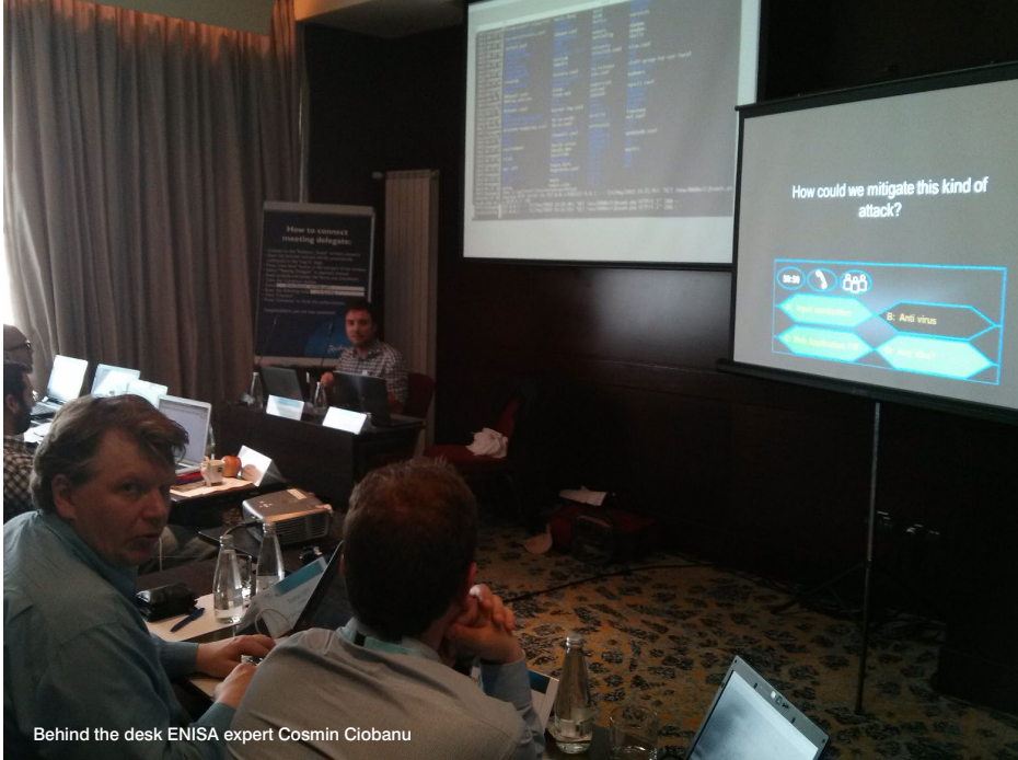
Behind the desk ENISA expert Cosmin Ciobanu