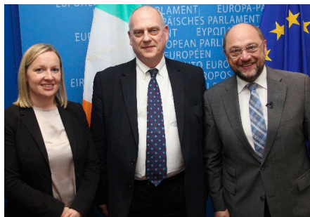
President in Council Lucinda Creighton & EP President, Martin Schulz (right) sign the ENISA Regulation into law in the presence of Giles Chichester.

13th May. The ENISA Regulation was adopted at the Council of the European Union, followed by its signing on 21st May in Strasbourg. The new Regulation entered into force on 19th June.